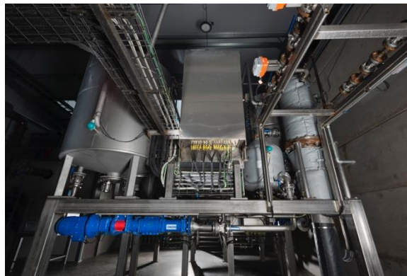
Hard bone separation and control