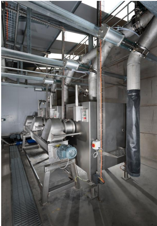
Size reduction mincers

These images illustrate the size reduction process and the separation process.