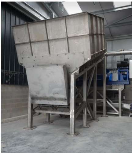
Raw material and Crusher