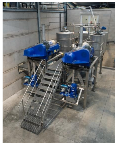
Separation and centrifuges